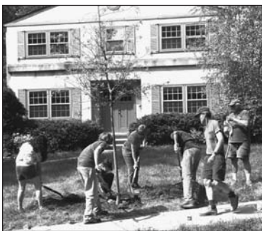
Neighbors planting trees in Bala Cynwyd in 2006

Saturday, 10 November 2007, tree planting (includes mulching)