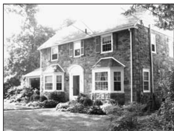
The Pulkins' Prize-Winning Garden at 101 E. Dartmouth Rd.

Nancy Pulkin's gift to the neighborhood is a subtle, small, perfectly scaled shade garden at 101 Dartmouth Road . Plant selections, in addition to being scaled to the house, provide