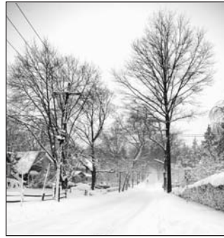
Bala Ave. after a 2006 Snowstorm

In our summer 2007 issue of The Gateway , we reminded neighbors of the responsibility of every homeowner to keep their abutting sidewalks and gutters clear of litter and trash. It is now time to remind everyone that we will soon be called upon to remove snow and ice from sidewalks that adjoin our lots. The following is from the Township's Policy Statement, dated 2000.